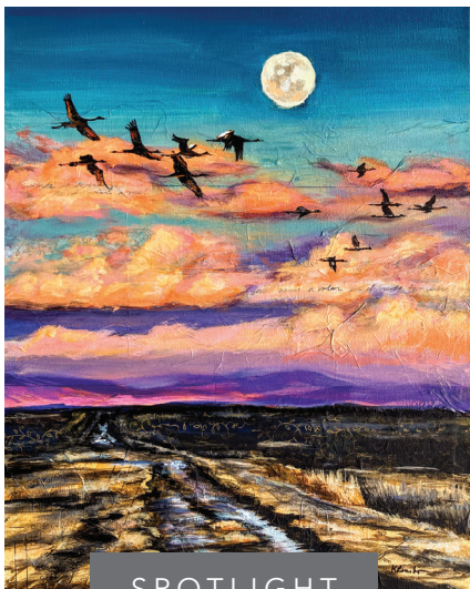
SPOTLIGHT Karen Lembo