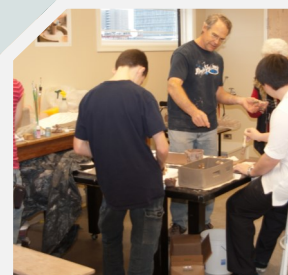
Students' first introduction to the new Pottery Studio.