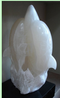
Pete Hassler's "Dolphin2"