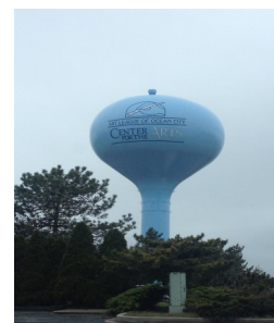
The Art League of Ocean City—Center for the Arts logo is now prominently displayed on the 94th Street water tower!