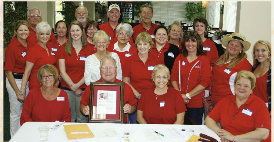
An enthusiastic team of red shirted volunteers guided the activities at the Betty Everson Memorial Golf Tournament