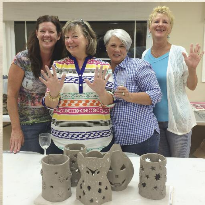
Pasta & Pottery students made luminaries.

Part of the mission of the Art League of Ocean City is to educate, and we reached out with a wide range of classes.