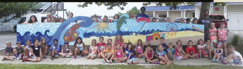
Art Adventure Camp students created a hands-on mural outside the Arts Center.