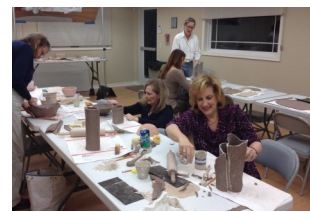
Sip & Ceramics

Bring your own beverage & snacks. We'll supply the rest! Paints, brushes, canvases, aprons, easels, and an artist to guide you!