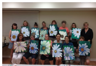
Brushes & Bubbly

Let the Art League of Ocean City make fundraising fun ! Enjoy a stress-free art experience and unleash your inner artist all while raising money for your charity or organization. Our instructor will guide you step-by-step as you create a masterpiece— no experience necessary ! Make up to $500 for your charity and support the arts in the Ocean City area!