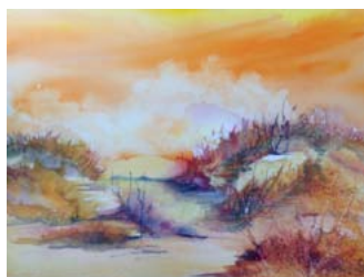
Paint a watercolor

Reserve your spot for Art Weekend, June 4 & 5!