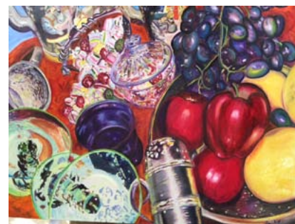
STUDIO E Becky Simonds