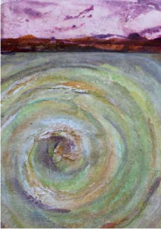
"Crop Circle" Angela Herbert-Hodges

IN THE THALER GALLERY: LANGUAGE OF COLOR IN THE LANDSCAPE