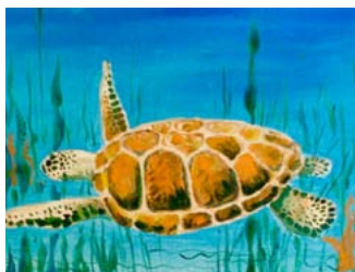
Paint an acrylic turtle

Be inspired by our talented art instructors, and create four unique art pieces for $100. Classes are 10 a.m. - noon and 1 - 3 p.m. on Saturday and Sunday. For adults and teens 13 and up. All materials provided. Space is limited!