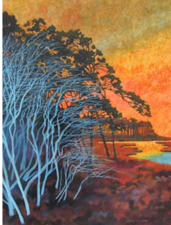
"Assateague Sunset" Debra Howard

IN THE GALLERIA: FOOD FOR THE SOUL GROUP SHOW