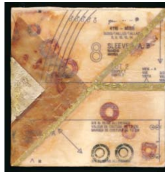
SPOTLIGHT GALLERY Susan Buyer

IN THE THALER GALLERY: PHOTOGRAPHY & DIGITAL MEDIA