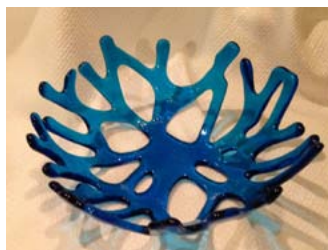
Make a glass coral bowl