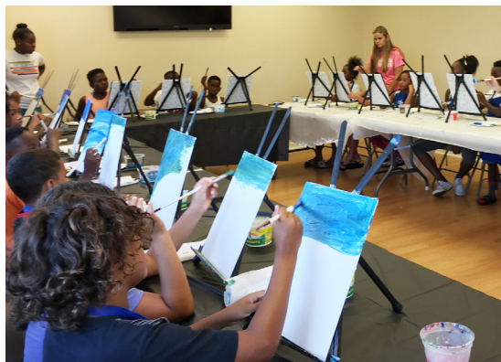
The Berlin Youth Group had fun painting during a visit in August to the Arts Center.

This program made possible by a grant from the PNC Foundation.