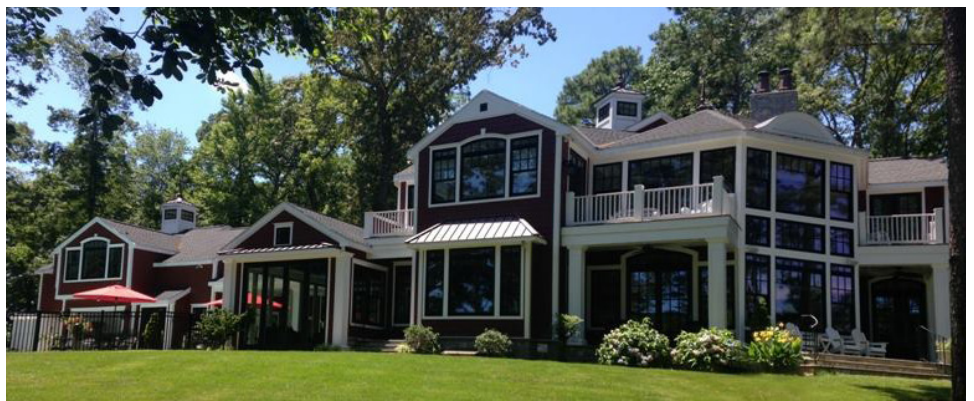
A featured home on the 2016 Sand Castle Home Tour

TICKETS FOR BOTH EVENTS @ artleagueofoceancity.org