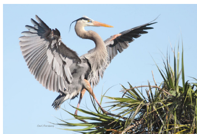
STUDIO E Carl Forsberg

IN THE THALER GALLERY: ARTISTS' CHOICE ALL-MEDIA GROUP SHOW