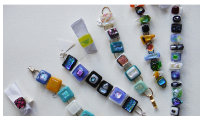
ARTISAN SHOWCASE Fay Kempton