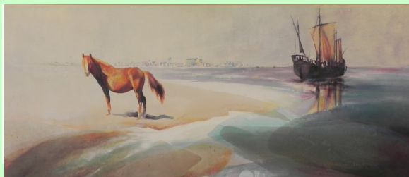
"Dance" Painting by Randy Hofman, Writing by JA Hill

A Collaboration by the ALOC and Ocean City Writers Group (Presentation on 1/20/15, see page 1 for details.)