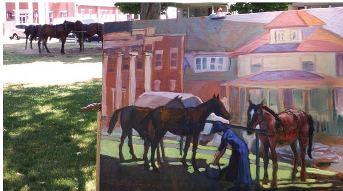
Figure Study for Paintings

CLICK HERE TO SEE A FULL SCHEDULE OF ART CLASSES AND FEES AND TO REGISTER