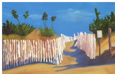
SPOTLIGHT GALLERY Jeanne Mueller