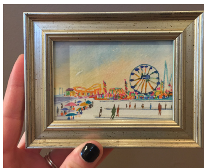
STUDIO E Small Works