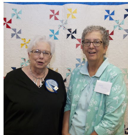
Above left: Carl Forsberg's colorful photographs of birds occupied Studio E in September.