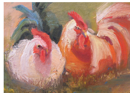
SPOTLIGHT GALLERY Sandra Esham