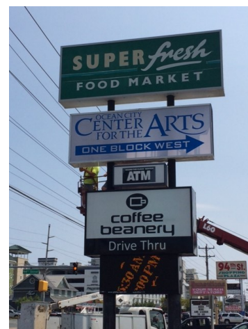
Ocean City Center for the Arts new sign!