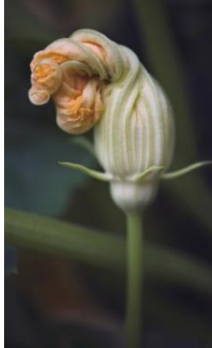
"Lightscape" by Selena Malott