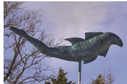
STUDIO E Tuve Tuvevesson