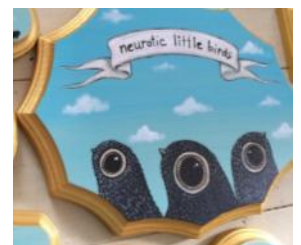
ARTISAN SHOWCASE Patti Backer