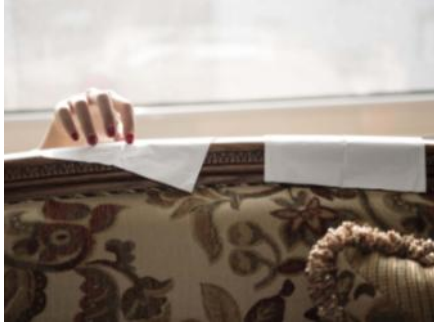
"Untranslatable" by Yuanyuan Liu