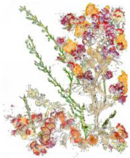
SPOTLIGHT GALLERY Kathie Gallion