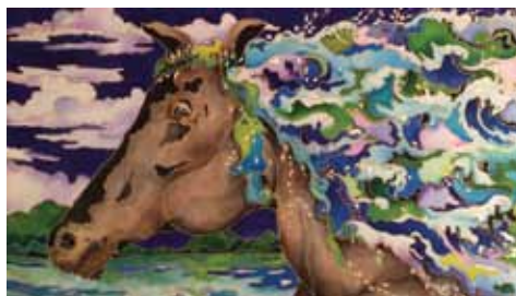
Silk Painters Int'l