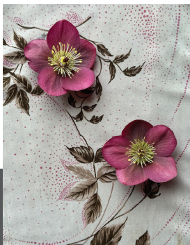
SPOTLIGHT "The Flower Show" Elaine Bean