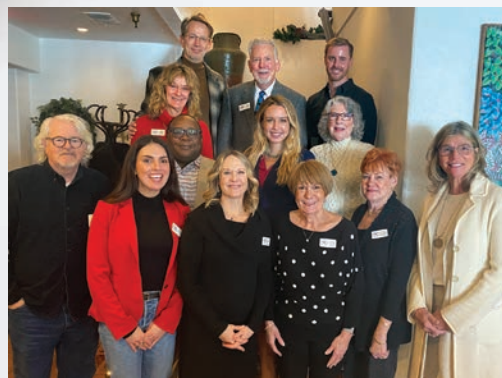
Art League 2022 Board of Directors

www.OCart.org Facebook.com/ArtLeagueOfOceanCity