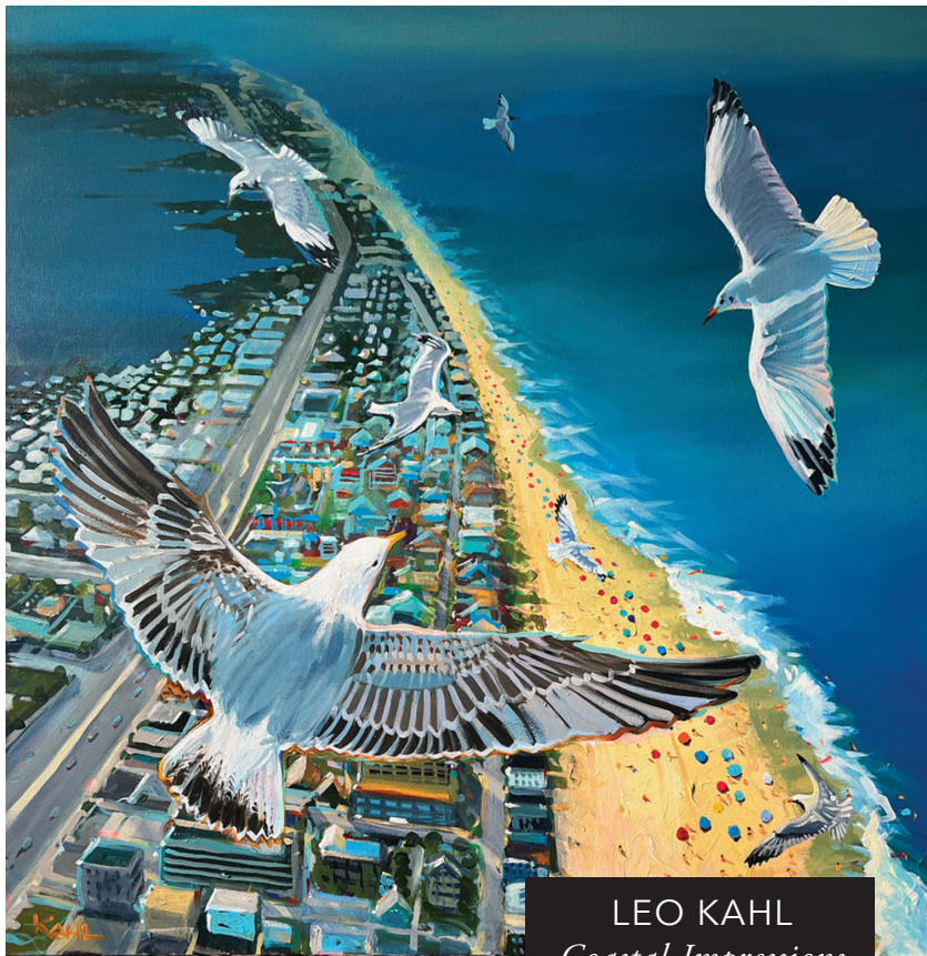
LEO KAHL Coastal Impressions

YOU ARE INVITED TO THE FREE FIRST FRIDAY OPENING RECEPTION OCTOBER 6, 2023 5-7 PM