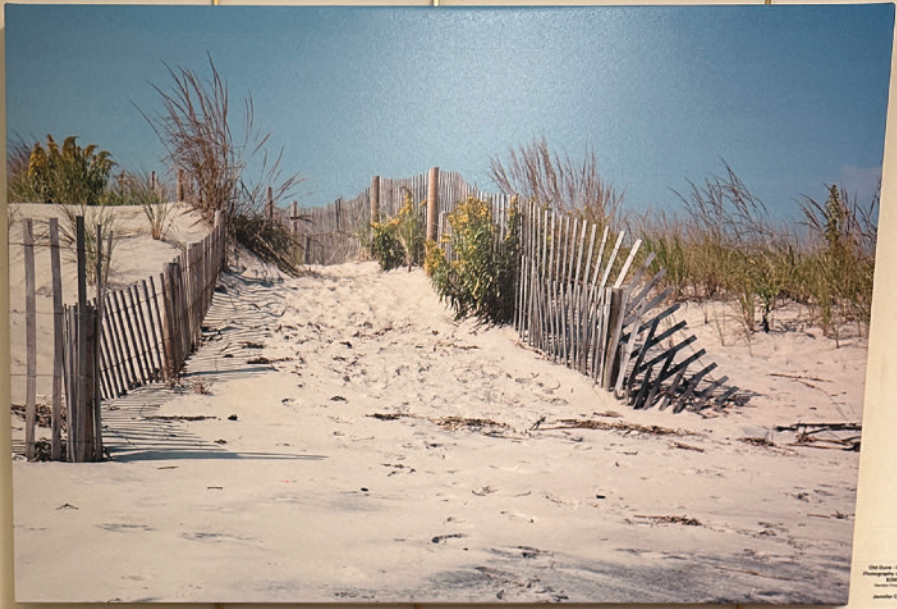
Old Barn